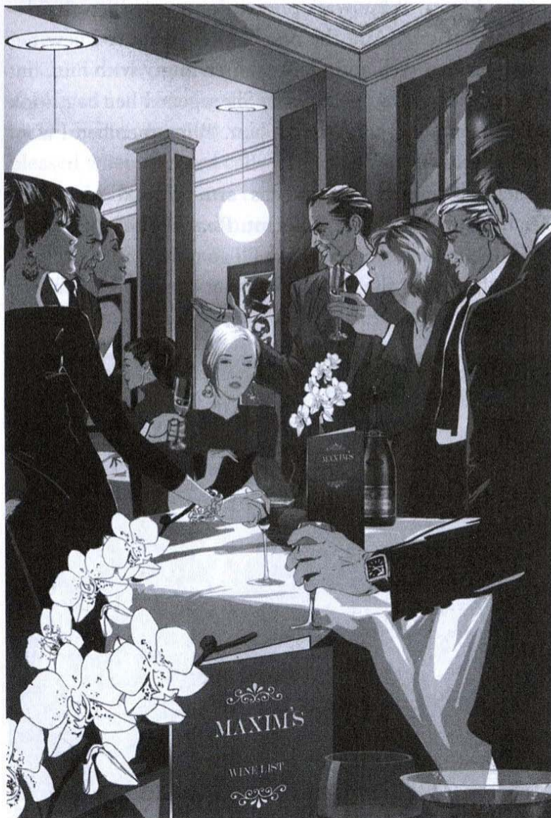
Everyone began to sing 'Happy birthday to you'.

Maxim's restaurant was busy – young men and women from offices, several older people, a group of students, and a few theatre people. Jennifer looked around for her friend. Claire usually sat near the window but tonight she was not there. Somebody was having a party and all the tables on that side were full. Then Jennifer heard Claire's voice behind her. 'Did you get lost? I've been here for hours.'